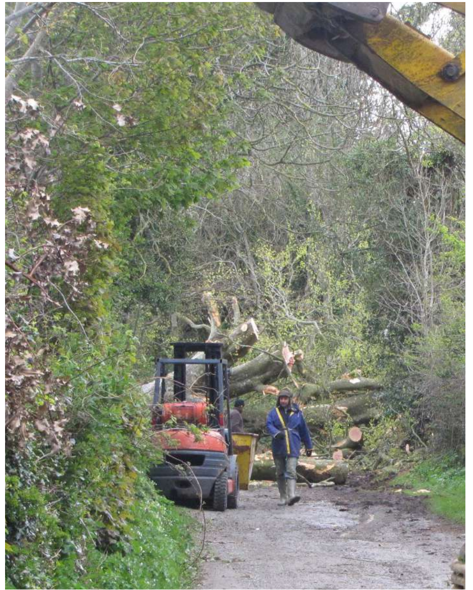
The great beech tree succumbed, on 29th April 2012, to a furious gust of wind from the North east, and was laid low across the lane. The Murphy families brought their team into immediate action to clear the lane, although Tina and Dan were disappointed not to miss school due to their promptness.