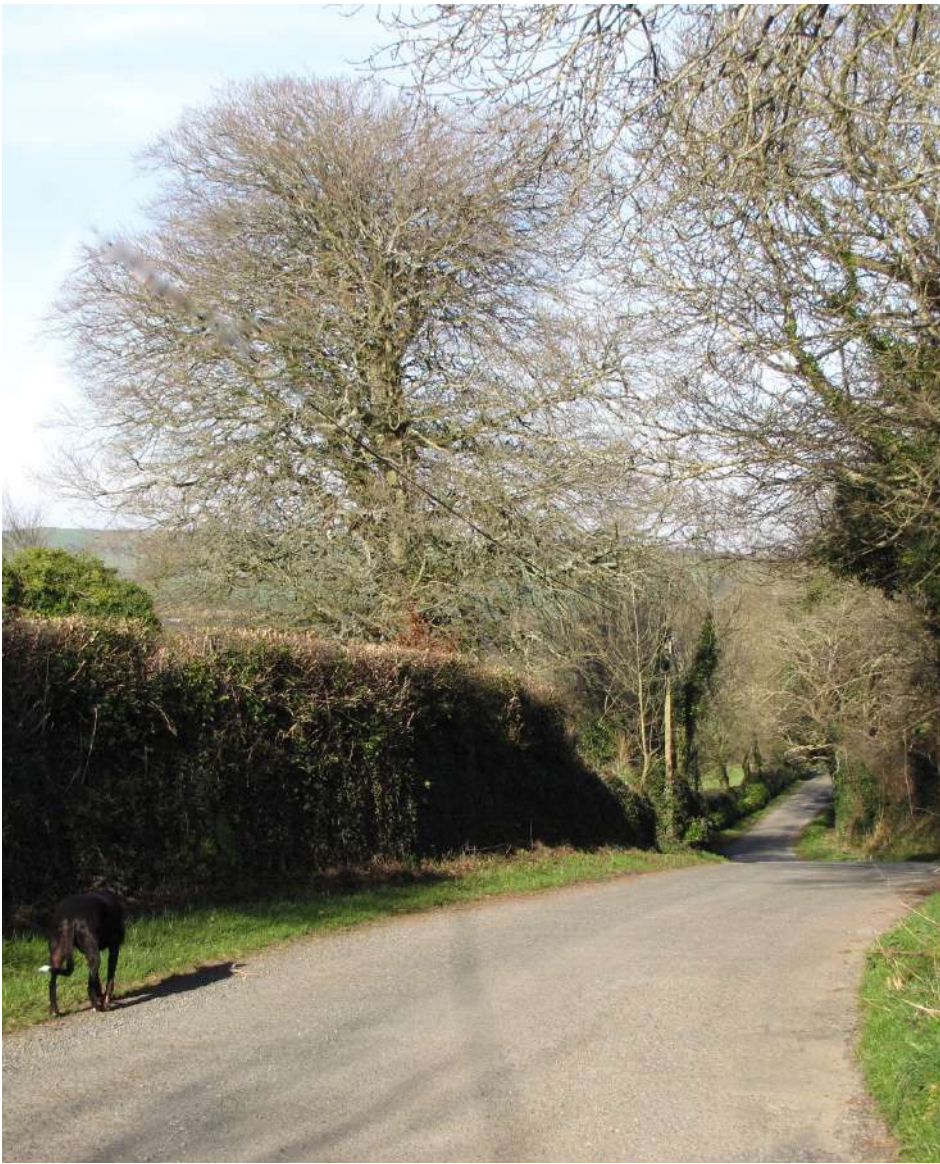
The great beech tree at Ballymurrin, 25 Feb 2012